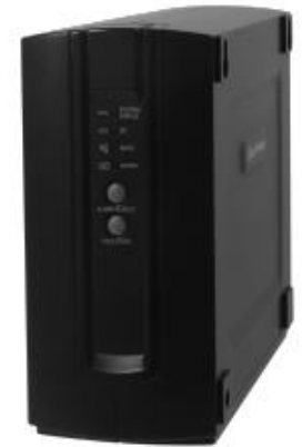
Desktop Battery Backup Unit (DT-BBU)